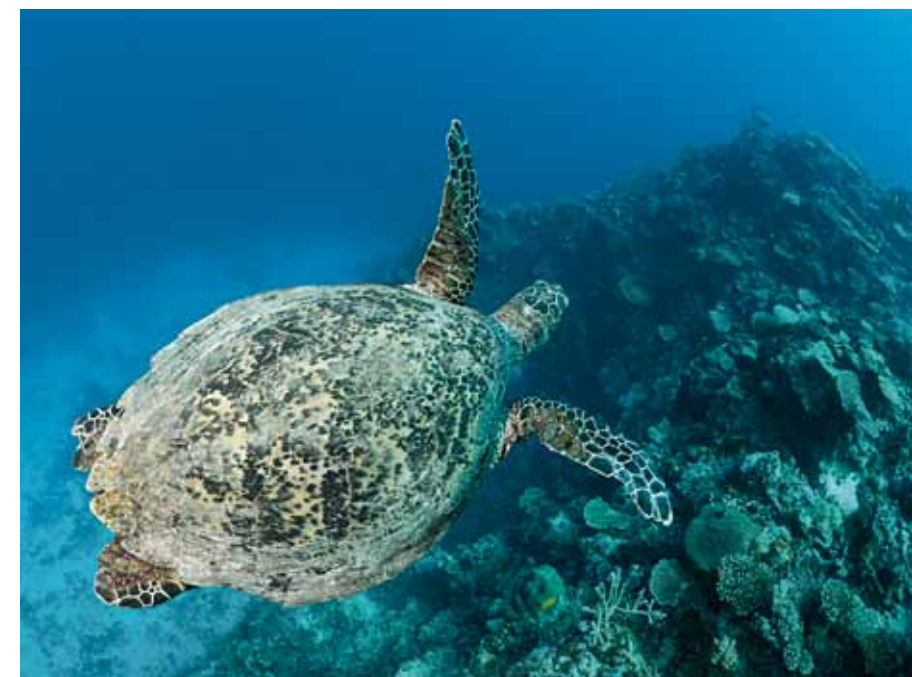
CLOCKWISE FROM LEFT: A whitetip and a group of blacktip reef sharks glide over a shallow coral reef; a hawksbill turtle at the Namena Marine Reserve; the infinity pool at Paradise Taveuni.